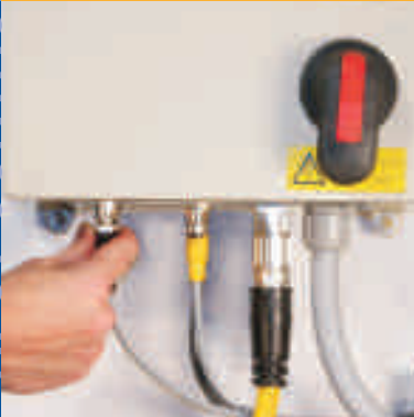
Smart Pre-Wiring Reduces Installation Time