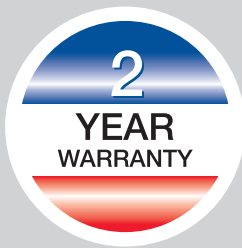
Trusted Two Year Warranty